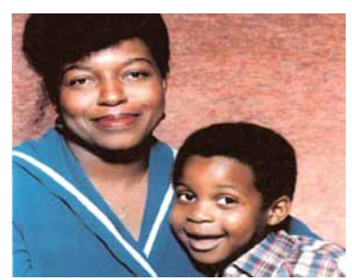
A Mother's Love Changes a Community

Love often compels us to respond to an unfortunate situation.